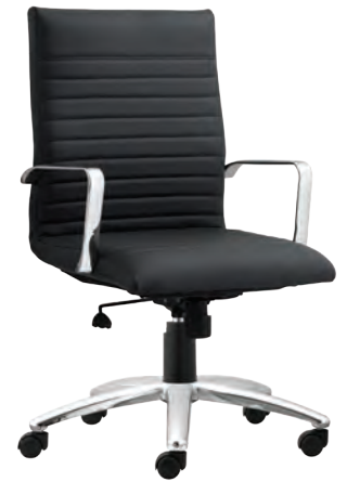
MODENA TASK CHAIR STXC515 Black QUICK SHIP