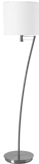
FLOOR LAMP STX-154FL QUICK SHIP