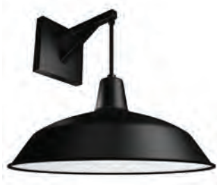
14" NIGHTSTAND PENDANT WALL LIGHT STX-WL280 QUICK SHIP