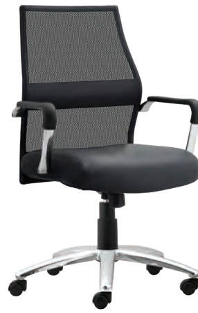
TREVI TASK CHAIR STXC562 Black QUICK SHIP