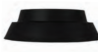
17" CEILING MOUNTED LIGHT STX-CL288 QUICK SHIP