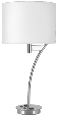
28" TWIN TABLE LAMP STX-153TT QUICK SHIP