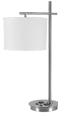
26" DESK LAMP STX-155DS QUICK SHIP