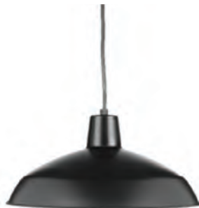
13" HANGING PENDANT STX-PD287 QUICK SHIP