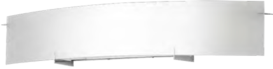
48" VANITY LIGHT STX-BV5-48 QUICK SHIP