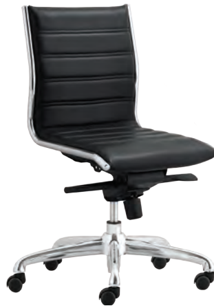
PALERMO TASK CHAIR STXC1002 Black QUICK SHIP