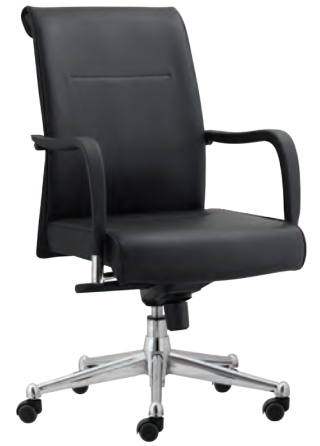
HELSINKI MID BACK TASK CHAIR STXC885 Black SPECIAL ORDER