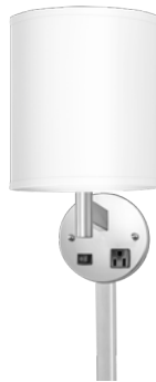
13.5" SINGLE WALL SCNCE STX-150WS QUICK SHIP