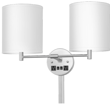
13.5" DOUBLE WALL SCNCE STX-151WD QUICK SHIP