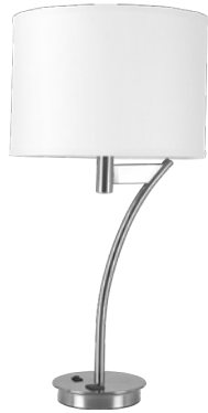
28" SINGLE TABLE LAMP STX-152TS QUICK SHIP