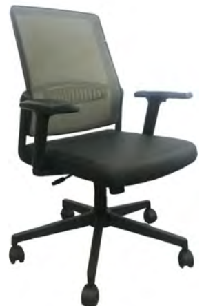
ERGO TASK CHAIR STXC715 Black QUICK SHIP