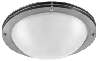
16" CEILING LIGHT STX-CL2 QUICK SHIP