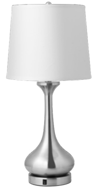
28" TABLE LAMP STX-1556ET-2SCKT SPECIAL ORDER